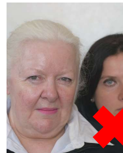
No group photos